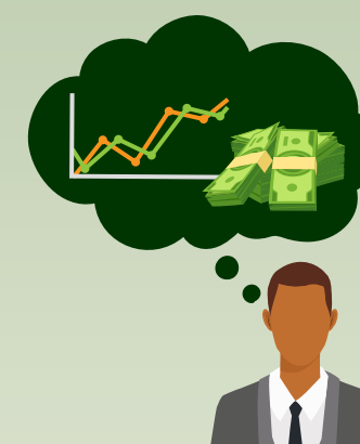
Construal or abstract mindset